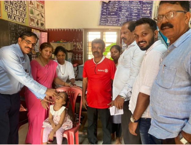
Pulse Polio: 1252 children benifited