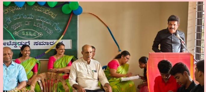
Send off to SSLC Interact students of GHS Attavara School