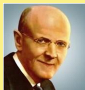
Rtn Paul Harris RI Founder