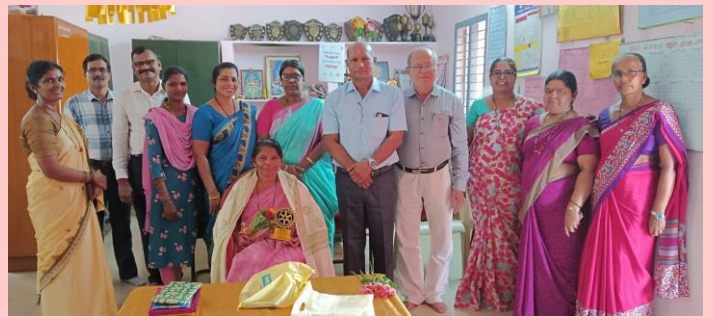
Headmistress & teachers of Mudushedde school felicitated