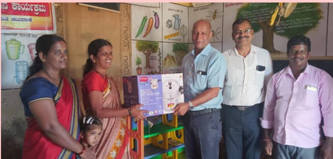
Donation to Anganavadi Tiruvail Vamanjur